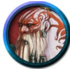
Kresk Hellibore (Logrus)