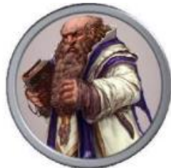
Duke Skorian Hellibore

Next day, Cassie stayed at the Camp while Aleyn Trumped back to Trellys at Jeseby Hall for his meeting with House Hellibore's representatives.